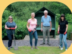
Staff from HSBC donated their time to tidy up the Hospice Celebration Garden.