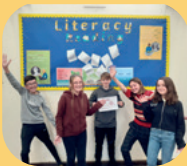
King Edwards IV High School had a Mufti day.