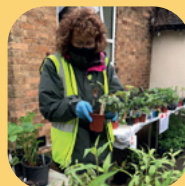
The village of Ranton had a plant sale to raise funds.

If you would like more information you can visit our website www.khhospice.org.uk to download a fundraising pack or call 01785 270808 and request one.