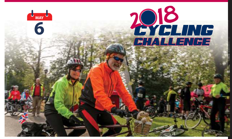
Pedal for Pounds! Choose from 8, 20, 45 or 65 mile routes! Prices start from £10, Kids ride FREE!