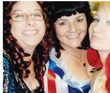
Whitehouse Pharmacy, Penkridge Supporting Dress Down Day 2010