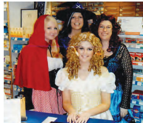
Whitehouse Pharmacy, Penkridge Supporting Dress Down Day 2010