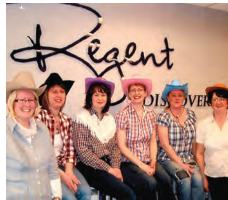
Regent Travel, Stone Supporting Dress Down Day 2010